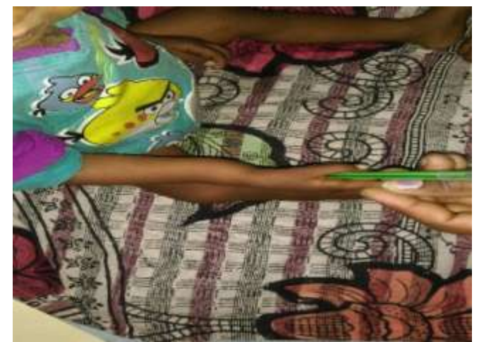
Right Wrist Showing Bone Deformities